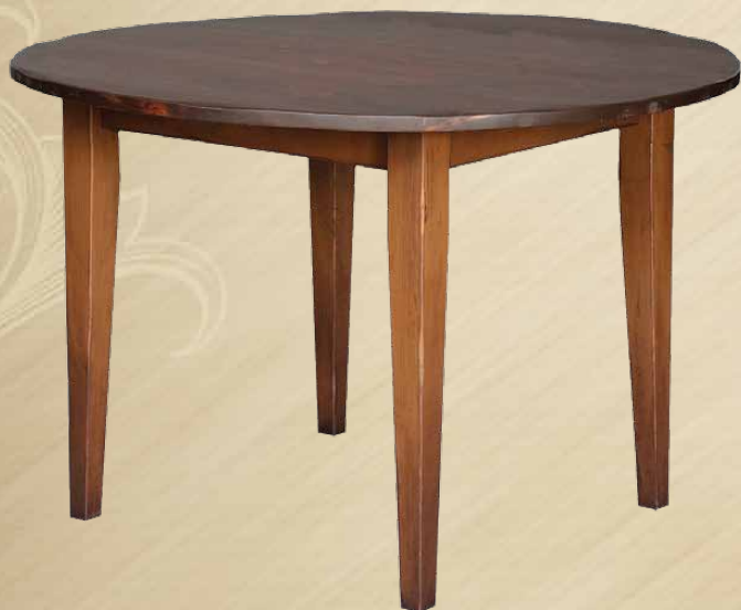
#25-J 4' Round Harvest Table 48 round