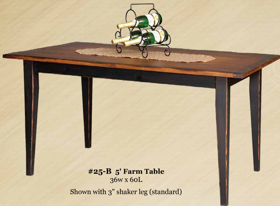
#25-B 5' Farm Table 36w x 60L