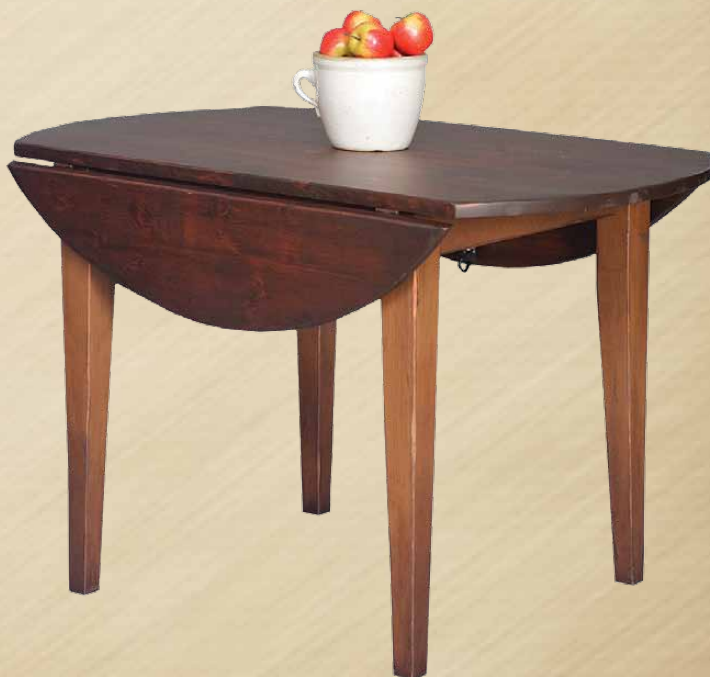
#25-K Round Harvest Table w/ 2 - 9" Drops with drops down 30w x 48L