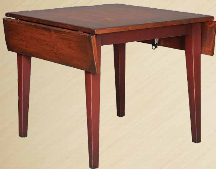
#25-P 3' Farm Table w/ 2 - 8.5" Drops 36w x 36L