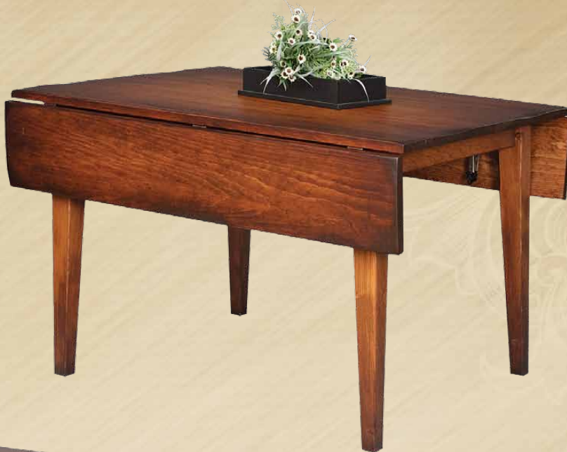
#25-S 4' Farm Table w/ 2 - 8.5" Drops 36w x 48L