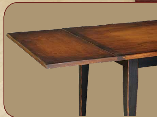
#24 Company Board 16w x 36d

*All Farm and Harvest tables available w/ 2 - 16" Company Boards