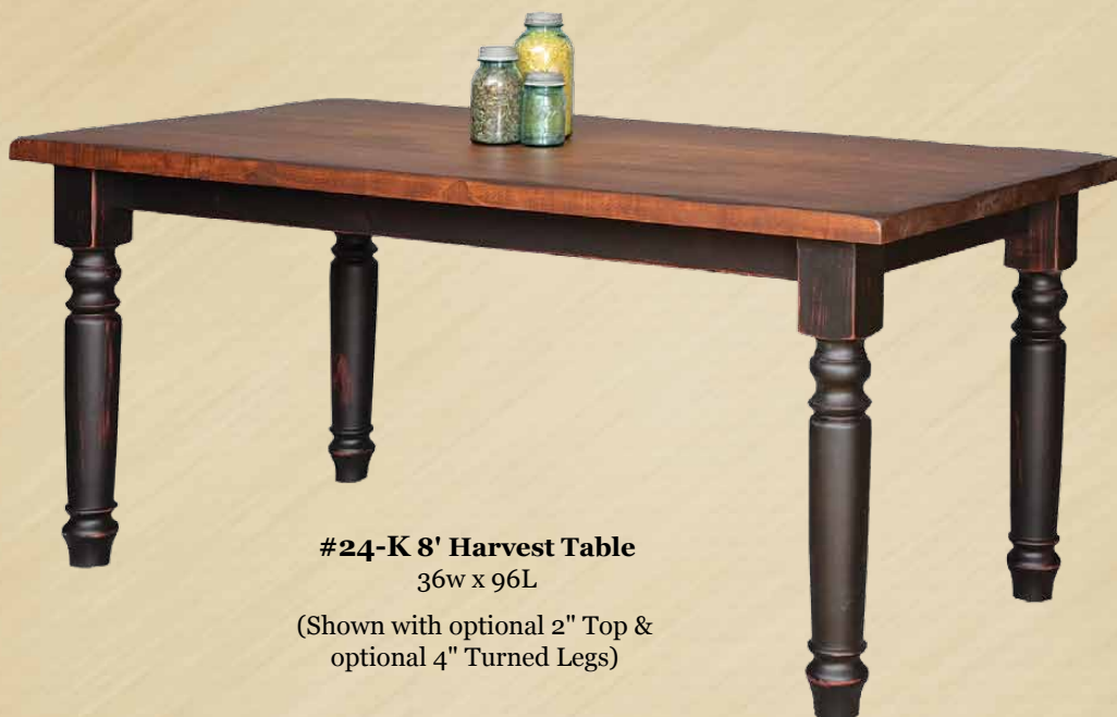
#24-K 8' Harvest Table 36w x 96L (Shown with optional 2" Top & optional 4" Turned Legs)