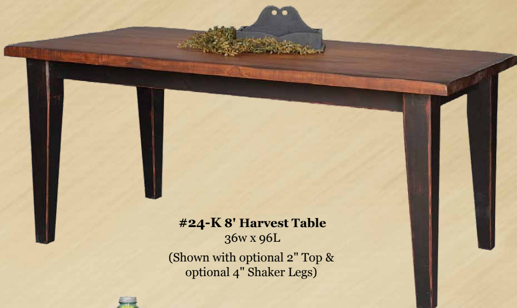
#24-K 8' Harvest Table 36w x 96L (Shown with optional 2" Top & optional 4" Shaker Legs)