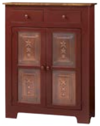
#112T Double Pie Safe with Tin 37½" w x 13" d x 48" h