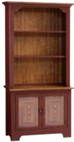
#64T Bookcase with Base Tin Doors 32" w x 13" d x 64" h

For the stay-at-home professional looking to stay organized or home library with everything from Camus to Hemmingway, storage abounds in these bookshelf and cabinet units that make any office respectable yet austere.