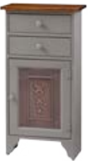
#93T Jelly Cabinet with Tin 17½" w x 10" d x 34" h