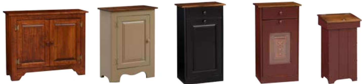
#33 2-Door Cabinet 37" w x 12½" d x 30" h