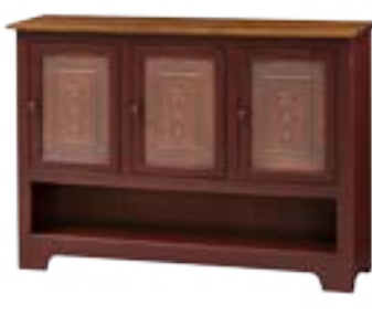
#117TO Triple Hall Cabinet with Tin, Open 47½" w x 12½" d x 33" h