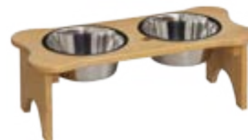
#91 1 Quart Dog Dish