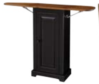
#36 Ironing Board Cabinet 11" d x 38" h 46" w — Board Extended 21" w — Board Folded Down