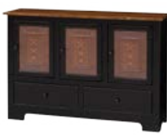
#117TD Triple Hall Cabinet with Tin, Drawers 47½" w x 12½" d x 33" h