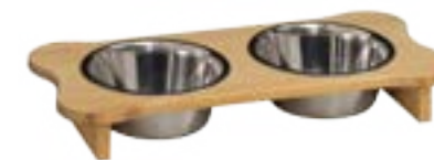
#90 3" 2 Quart Dog Dish