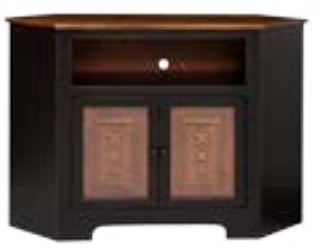
#103T 2 Door Corner Plasma Cabinet with Tin 47" w x 16" d x 33" h