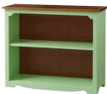
#65 Bookcase 37" w x 13" d x 30" h