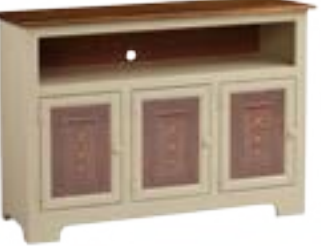
#155T 3 Door Plasma Cabinet with Tin 47½" w x 16" d x 33" h