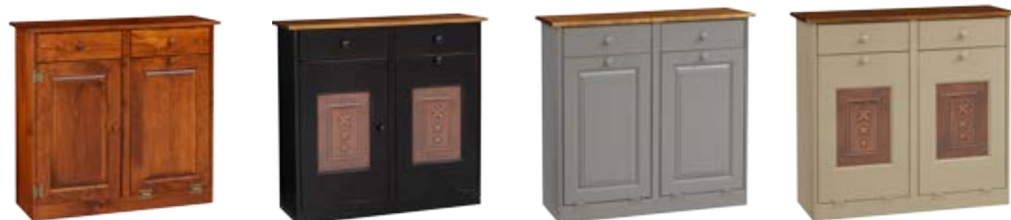
#84W Double Trash Bin and Cabinet with Wood 39½" w x 12" d x 35" h