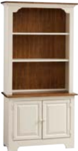
#64W Bookcase with Base Wood Doors 32" w x 13" d x 64" h