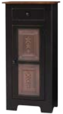
#110T Single Pie Safe with Tin 23" w x 13" d x 48" h