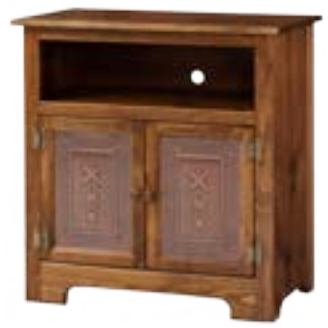
#130T 2-Door Plasma Cabinet with Tin 32" w x 16" d x 33" h