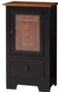
#125T Single Hall Cabinet with Tin 19½" w x 12½" d x 33" h