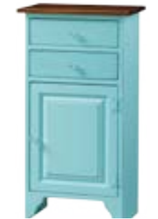
#93W Jelly Cabinet with Wood 17½" w x 10" d x 34" h