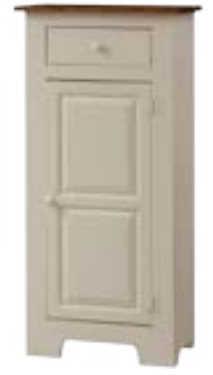
#110W Single Pie Safe with Wood 23" w x 13" d x 48" h