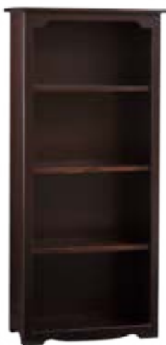
#62 Large Bookcase 26½" w x 13" d x 58" h