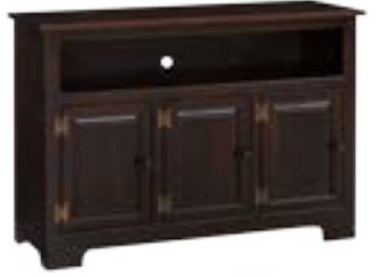
#155W 3 Door Plasma Cabinet with Wood 47½" w x 16" d x 33" h