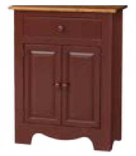
#96 Microwave Cabinet 26½" w x 13" d x 34" h