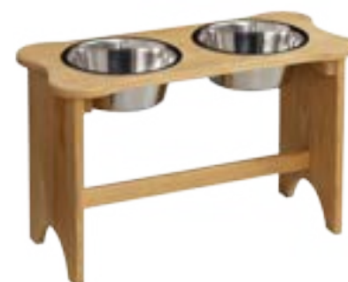
#88 15" 2 Quart Dog Dish

Accents Add personality to any corner, nook or cranny with these attractive accent pieces, sure to add character to any home.