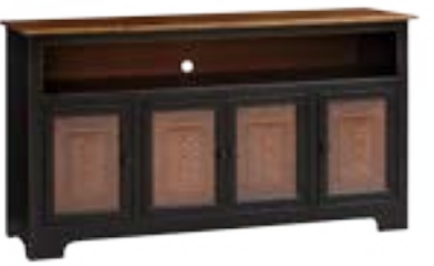
#135T 4 Door Plasma Cabinet with Tin 60" w x 16" d x 33" h