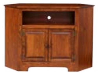
#103W 2 Door Corner Plasma Cabinet with Wood 47" w x 16" d x 33" h