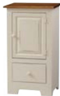
#125W Single Hall Cabinet with Wood 19½" w x 12½" d x 33" h