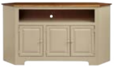
#104W 3 Door Corner Plasma Cabinet with Wood 61" w x 16" d x 33" h