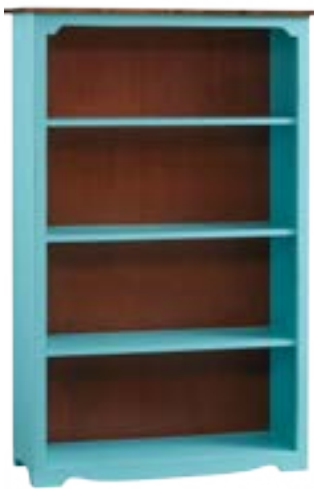
#63 Extra Large Bookcas 36" w x 13" d x 58" h