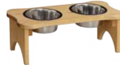
#89 7" 2 Quart Dog Dish