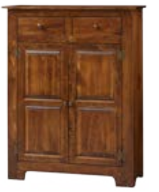
#112W Double Pie Safe with Wood 37½" w x 13" d x 48" h