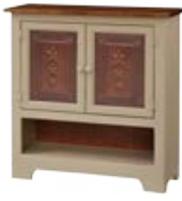
#122TO Double Hall Cabinet with Tin, Open 32" w x 12½" d x 33" h