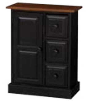
#30 Small Sewing Cabinet 22" w x 11½" d x 28½" h