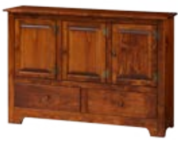
#117WD Triple Hall Cabinet with Wood, Drawers 47½" w x 12½" d x 33" h