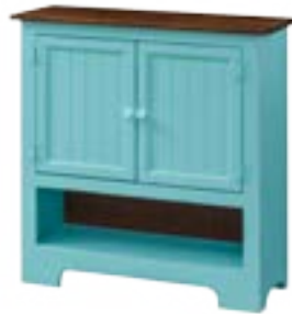
#122WO Double Hall Cabinet with Wood, Open 32" w x 12½" d x 33" h