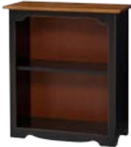
#60 Small Bookcase 26½" w x 13" d x 30" h