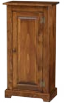
#37 Ironing Board Cabinet No Leaves 21" w x 11" d x 38" h