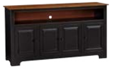
#135W 4 Door Plasma Cabinet with Wood 60" w x 16" d x 33" h