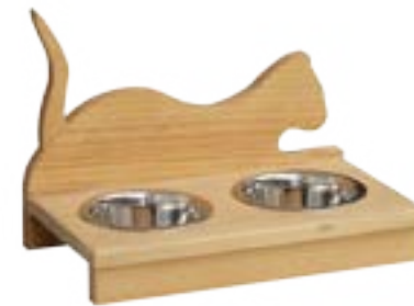
#94 1 Pint Cat Dish