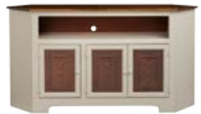
#104T 3 Door Corner Plasma Cabinet with Tin 61" w x 16" d x 33" h