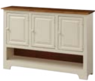
#117WO Triple Hall Cabinet with Wood, Open 47½" w x 12½" d x 33" h