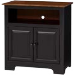
#130W 2 Door Plasma Cabinet with Wood 32" w x 16" d x 33" h