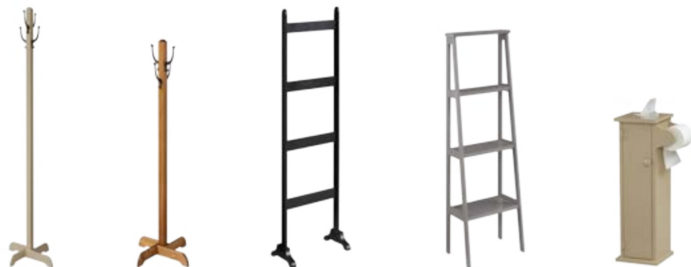
#201 Clothes Tree 69" h