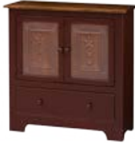
#122TD Double Hall Cabinet with Tin, Drawer 32" w x 12½" d x 33" h