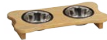
#92 1 Pint Small Dog Dish